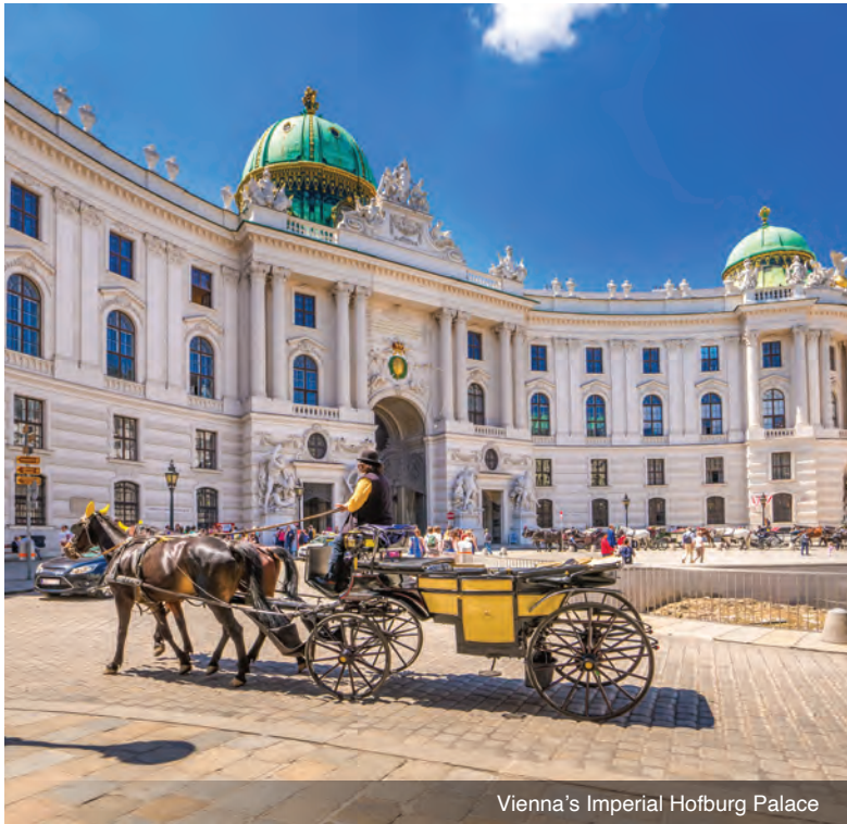
Vienna's Imperial Hofburg Palace

DAY 8 Budapest, Hungary: This morning, relax onboard your Star-Ship while sailing from Slovakia to Hungary. In Budapest, an exciting program awaits. As you sail into this magnificent city, it becomes immediately apparent why the Hungarian capital is known as the 'Pearl of the Danube'. Venture into the city independently or make use of our onboard bikes to explore Budapest's hidden treasures. Meals: B, L, D