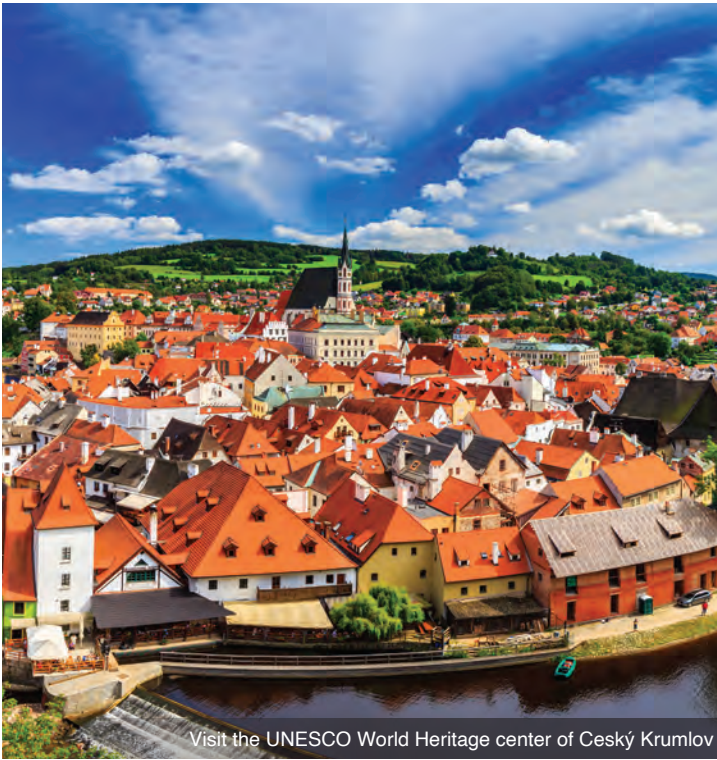
Visit the UNESCO World Heritage center of Český Krumlov