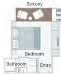
Panorama Balcony Suite