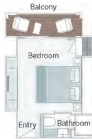
Grand Balcony Suite