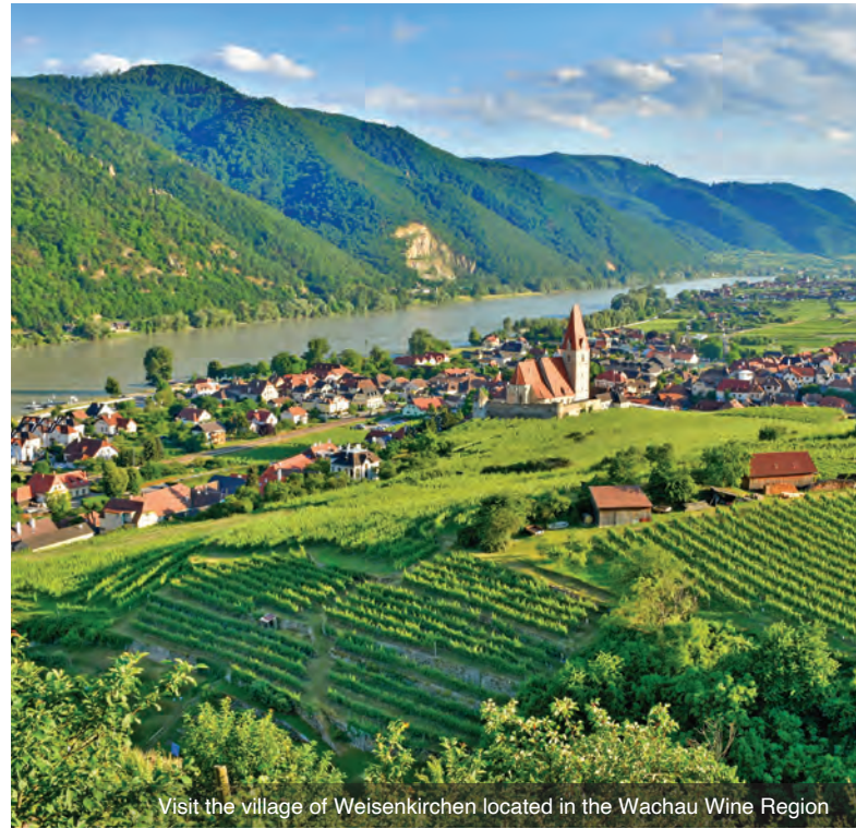
Visit the village of Weissenkirchen located in the Wachau Wine Region

DAY 1 USA / Munich, Germany: Depart the USA on your overnight flight to Munich, Germany.