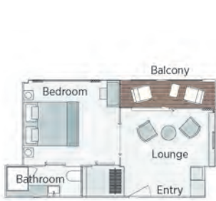
Owner's One-Bedroom Suite